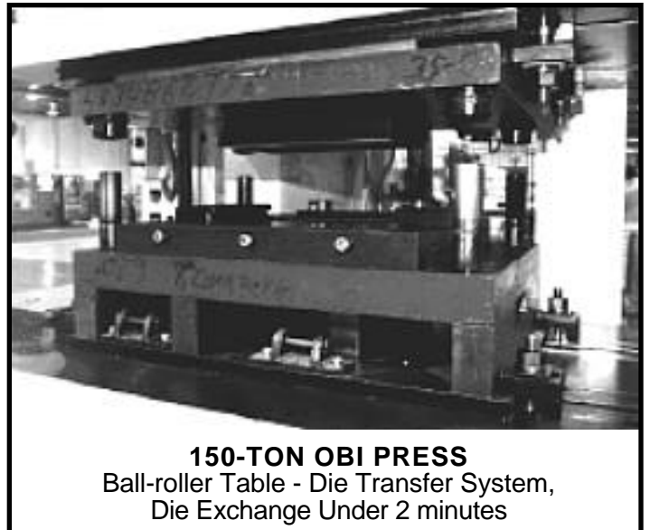
150-TON OBI PRESS Ball-roller Table - Die Transfer System, Die Exchange Under 2 minutes